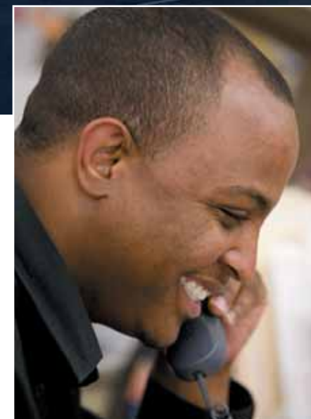
When it comes to the fastest, most reliable technical support, Honeywell is the best in the business