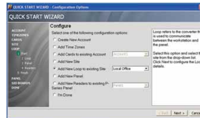
Quick Start Wizards walk you through setting up your system