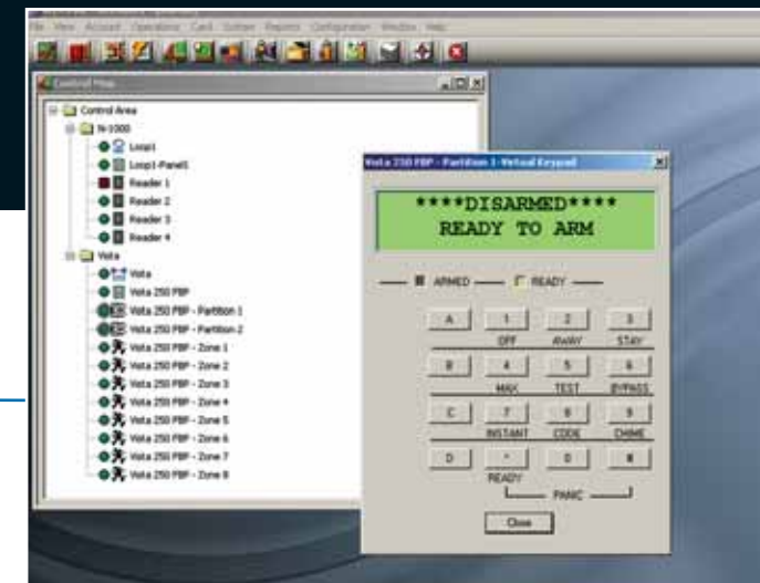
Arm/Disarm with a click of a mouse